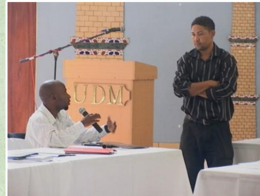
UDM students having classroom lectures

ABU – Ahmadu Bello University GBU – Gaston Berger University Tana – University of Antananarivo USTHB – University Of Science And Technology Houari Boumediene