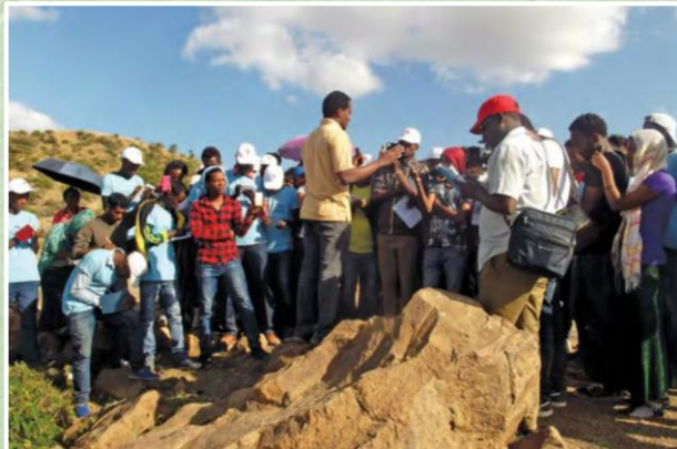
BDU students do field research in Ethiopia