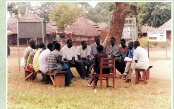
Makerere researchers discuss health challenges with refugees and internally displaced people in Uganda

ABU – Ahmadu Bello University GBU – Gaston Berger University Tana – University of Antananarivo USTHB – University Of Science And Technology Houari Boumediene