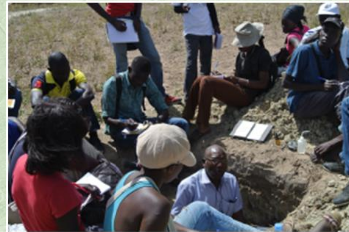
GBU students learn how soil quality affects agricultural risk in the Senegal River Valley